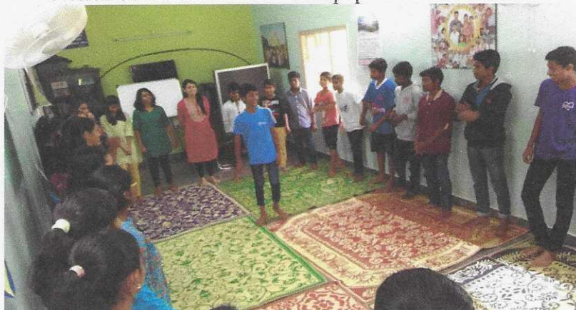
Session on life skill and leadership qualities

The other workshop was organised in October 2018 at Bangalore for three days for the children and young girls affected by HIV, where 46 children and young girls participated. The sessions on Life skills and Moral teaching were of great help to the girls who are the children of HIV affected parents. For the others who were full or semi orphan children, a separate sessions were held on life skills, leadership qualities, moral teaching etc.