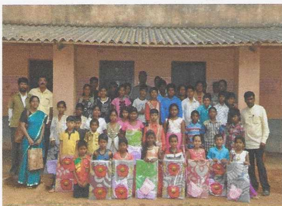
35 taking part in 10 days camp in October 2018

Since the community, particularly the children, were requesting the Trust for a number of such camps to be organised, similar to the one that was organised in the year 2017, so that a large number of children could benefit, two camps were organised at different locations for two different groups of children and youths during the school vacations. One was organised for 10 days between 8 th and 18 th October 2018 at Doddaballapur, where 35 young boys and girls had participated and benefited. The subjects taught were of the most important ones such as life skills, leadership qualities, moral teaching, spoken English and also sessions for Maths and Science were held especially for 9 th and 10 th class students.